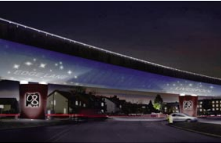
The Rocket junction is set for a spectacular new look.

The work in this area has included highway