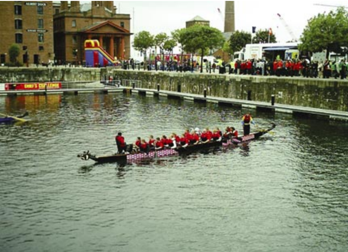
The team takes to the water at the Albert Dock.