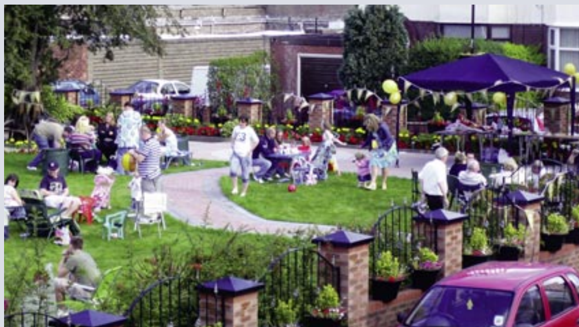
Residents enjoy the family fun day on Lister Community Green.

Local community groups interested in the New Communities Fund can call into the Job Bank on Tunnel Road to find out more, or ring 0151-233 6189 or 0151-233 6182 for information or an application form.