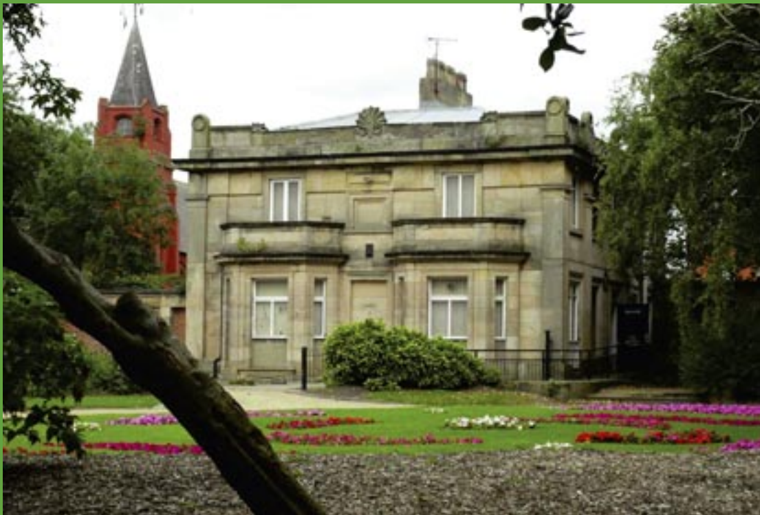
With appropriate funding, a new use could be found for the lodge at Botanic Park.