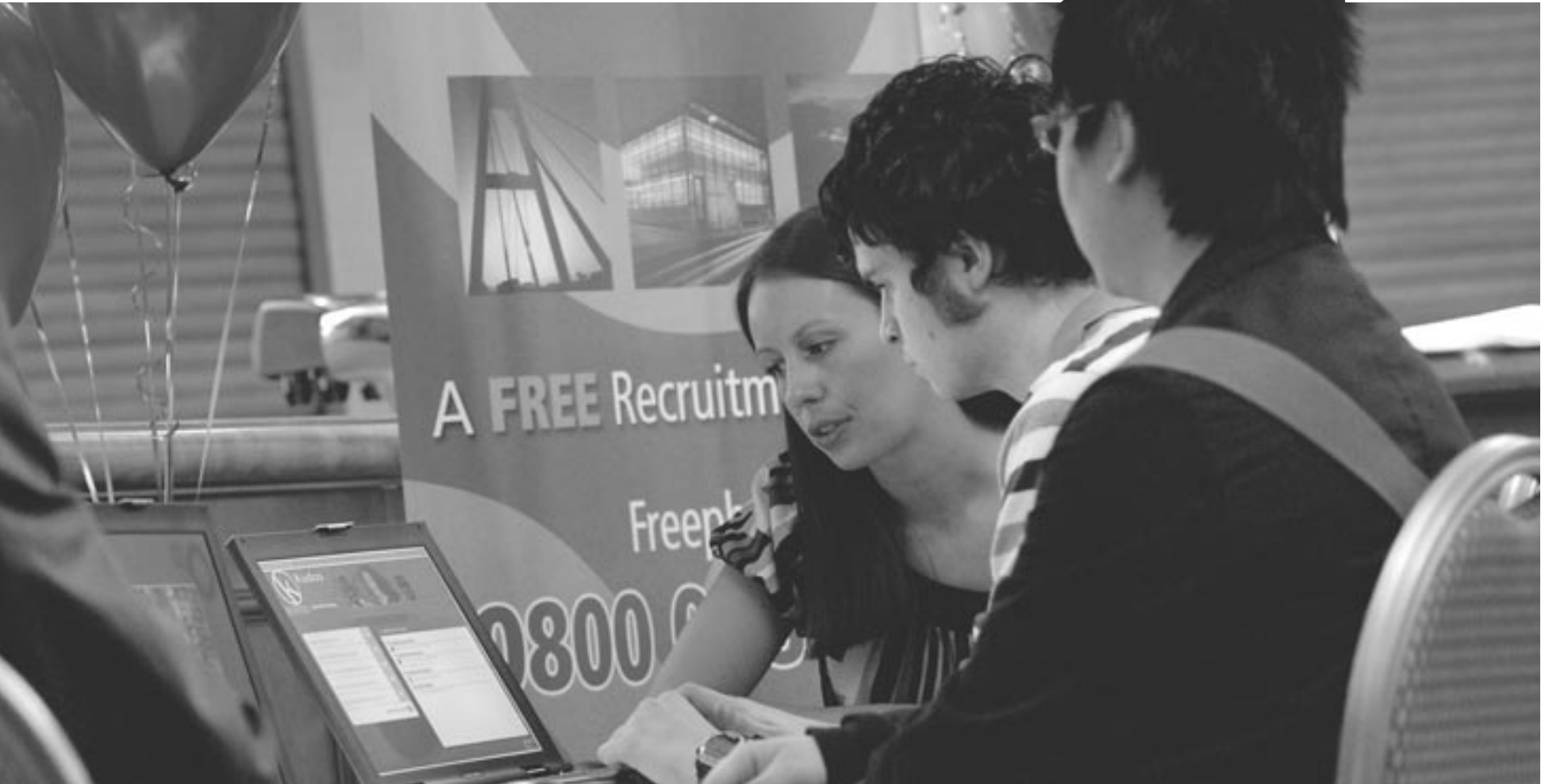
Whether you're 16 or 18 you can access a wide range of support.