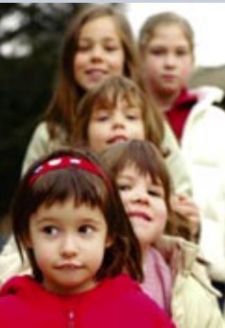
Young children will benefit from the Local Network Fund.