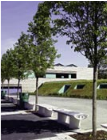
TV fame for the Academy.

Kensington's Academy of St Francis of Assisi was the star of a recent TV programme on how schools can be green. The school was included in a programme called the £45 Billion Question which is broadcast on the cable and satellite Teachers' TV channel. The Academy was the first in the country to choose the environment as its specialist subject and has a variety of green features. These include solar panels on its roof and using rainwater to flush toilets.