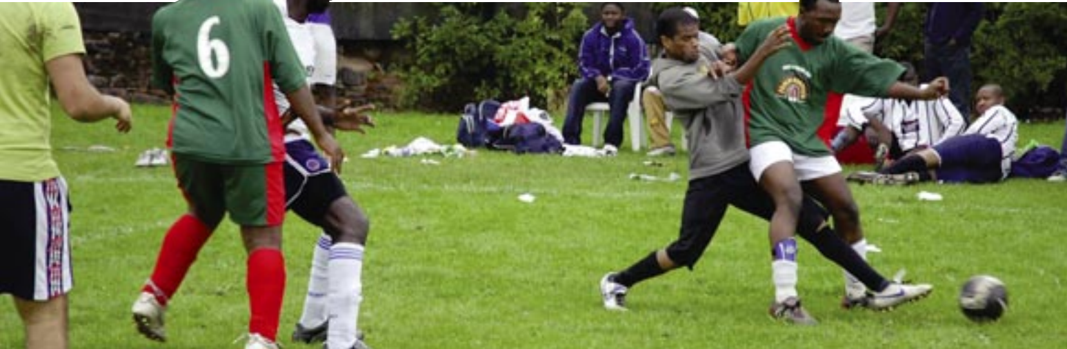
Action from the Sierra Leone v Angola match in the tournament.