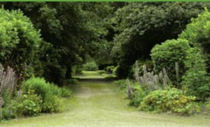
One of the many pleasant paths through the park.

"For example, as well as being a great leisure facility, it could be possible to put the park on the local tourist trail by redeveloping the old air raid shelters and the lodge as an exhibition about the history of the park and local people's experiences during the war years."