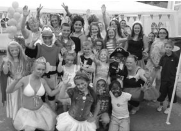
Local people enjoy the Gresham Street party.