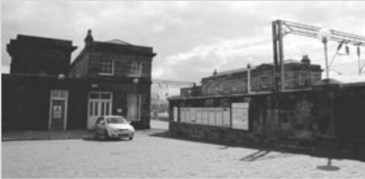
Edge Hill - in line for a new artistic station in life.