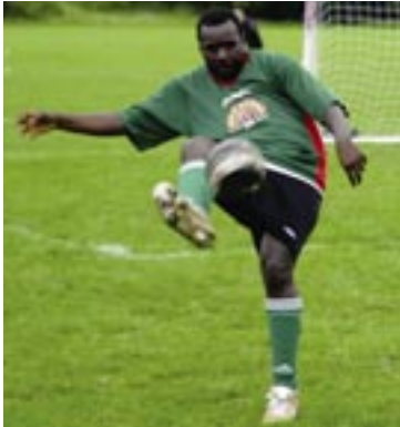
Great ball skills were on display.

the same time." As well as Active City the event was sponsored by the Novas Group and Community Seven with contributions from Bar Hannah and Wetherspoons. Countries represented in the tournament were England, Ireland, Scotland, Wales, Jamaica, Trinidad/ Tobago, Italy, Ghana, China, Yemen, Nigeria, Sierra Leone, Burundi, Zimbabwe, Saudi Arabia, Sudan, Chad, Poland, Congo and Kosovo.