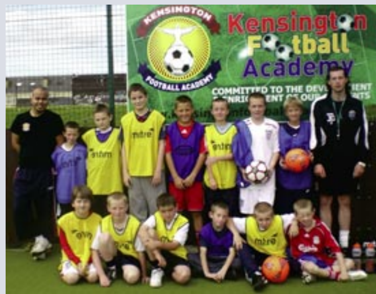
The New Communities Fund is helping local youngsters to receive expert coaching in football skills.

One of the recent groups to receive a grant is the Kensington Football Academy (KFA), a community-led project which is now in its third year.