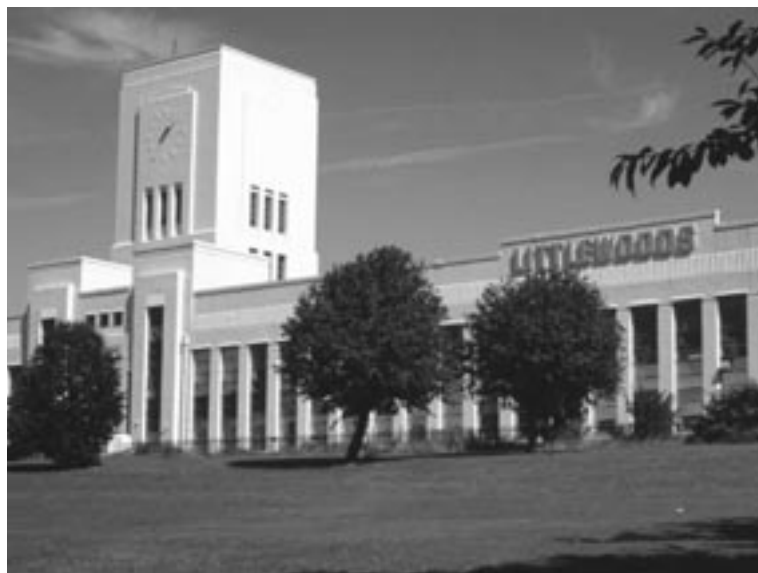
A striking view of the Littlewoods building from Botanic Park.