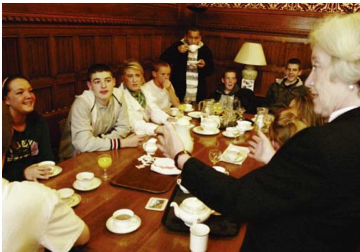
Something's brewing - Baroness Hayman chats to the young people over tea.