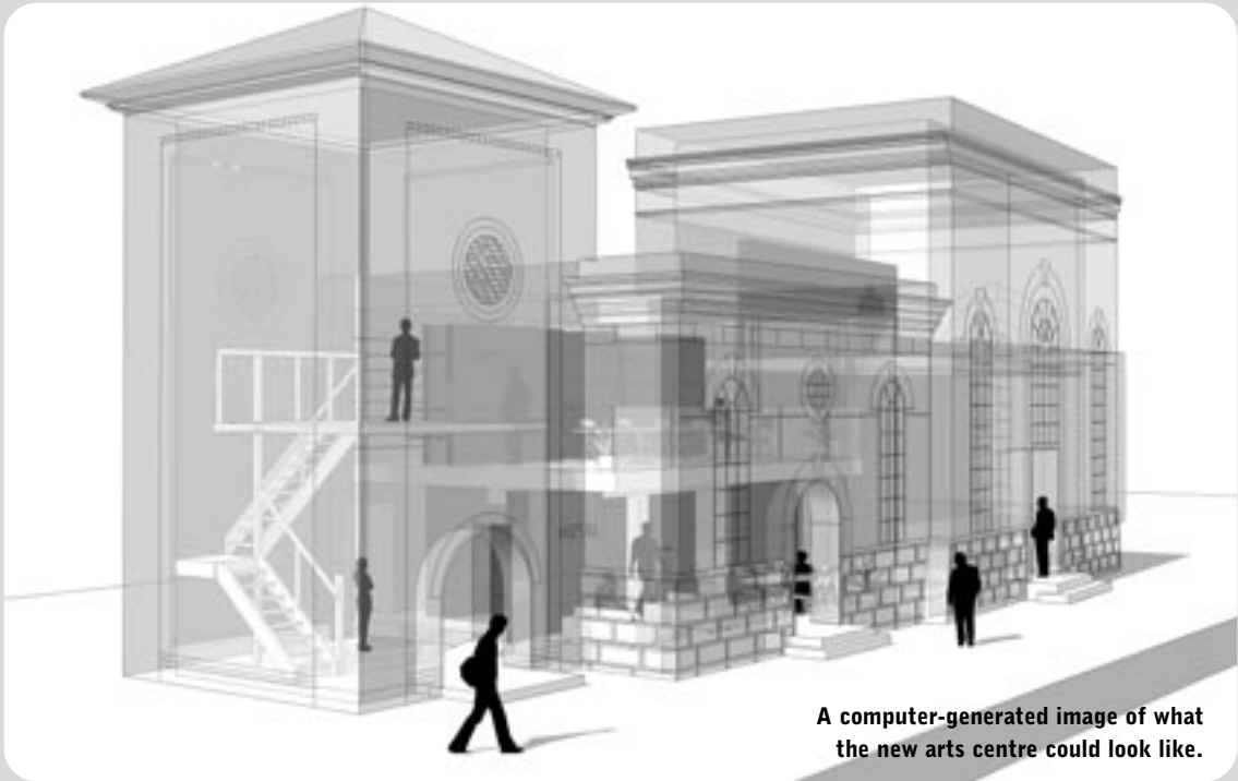
A computer-generated image of what the new arts centre could look like.

investing more money here, by starting up businesses like cafes or independent shops." Metal has the full co-operation of Northern Rail, which runs the station. A spokesman said: "We are trying to bring a number of redundant stations across the network back to life and this project is part of that. It is really good for the railway. "It brings a presence back into the building and the local community will also see a long-term benefit."