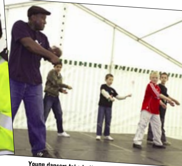
Young dancers take to the stage.