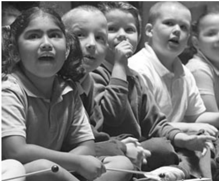
Some of the pupils who performed at the Phil.

The project, which is now in its fourth year, also receives support from the Foyle Foundation.