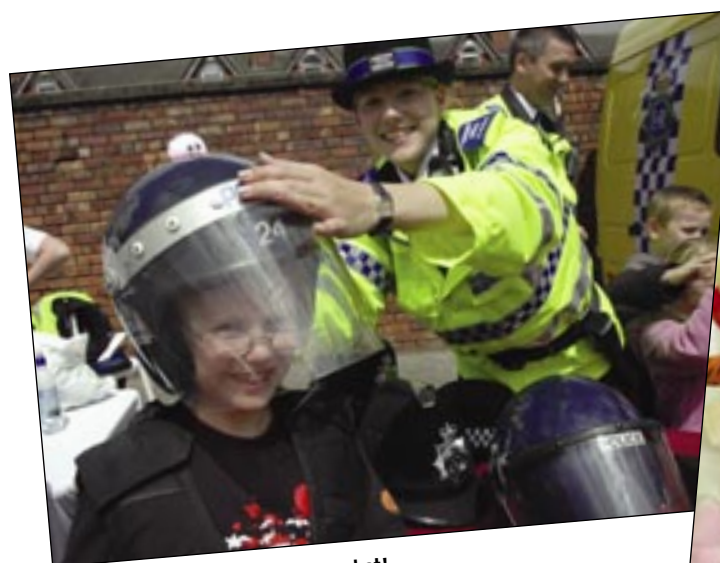
If you want to get ahead, get a hat!

Children also had the chance to sit in a fire engine and a police car, and to try the sirens in both!