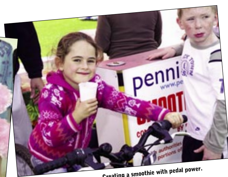
Creating a smoothie with pedal power.