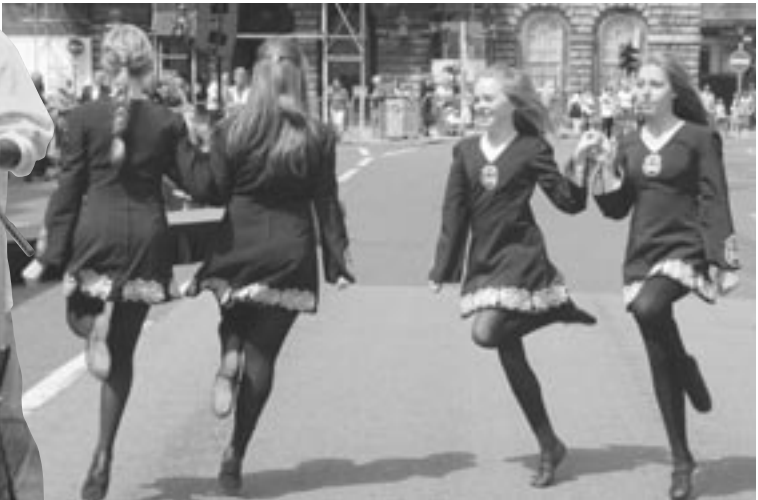
A wide range of Kensington performers took part in the parade.