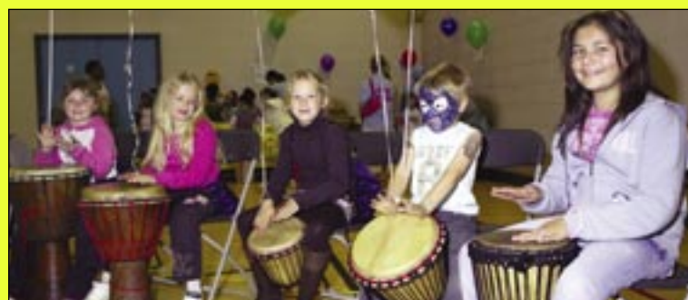
Drumming up a storm at the festival.