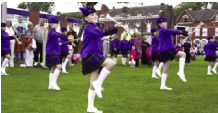
Stepping out in style – the Kensington Monarch Majorettes.

As a result, local residents turned out in force with an estimated 6,000 people passing through the gates of Fairfield Police Club at some point during the Fun Day on Saturday July 7th. This was around double the attendance in 2006.