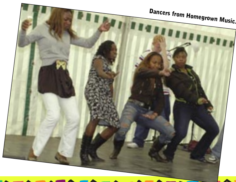
Dancers from Homegrown Music.