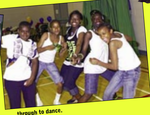
.....through to dance.

popular feature of the festival and this year matches in the annual multi-cultural five-a-side football tournament were held both at the sports centre and Botanic Park.