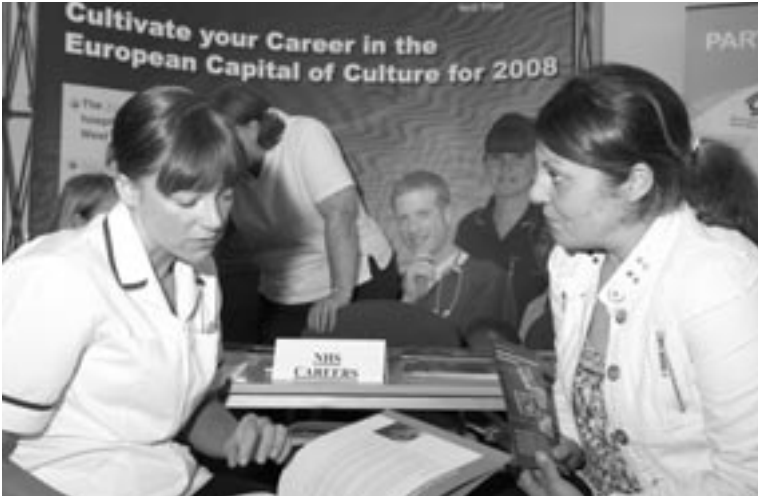
Information on hundreds of job opportunities was on offer.

healthcare jobs available, and plans in the pipeline to redevelop the Royal, this is a good time for Kensington residents to be considering a career in this field." Information about all the job opportunities currently available in the NHS can now be accessed online at www.jobs.nhs.uk .