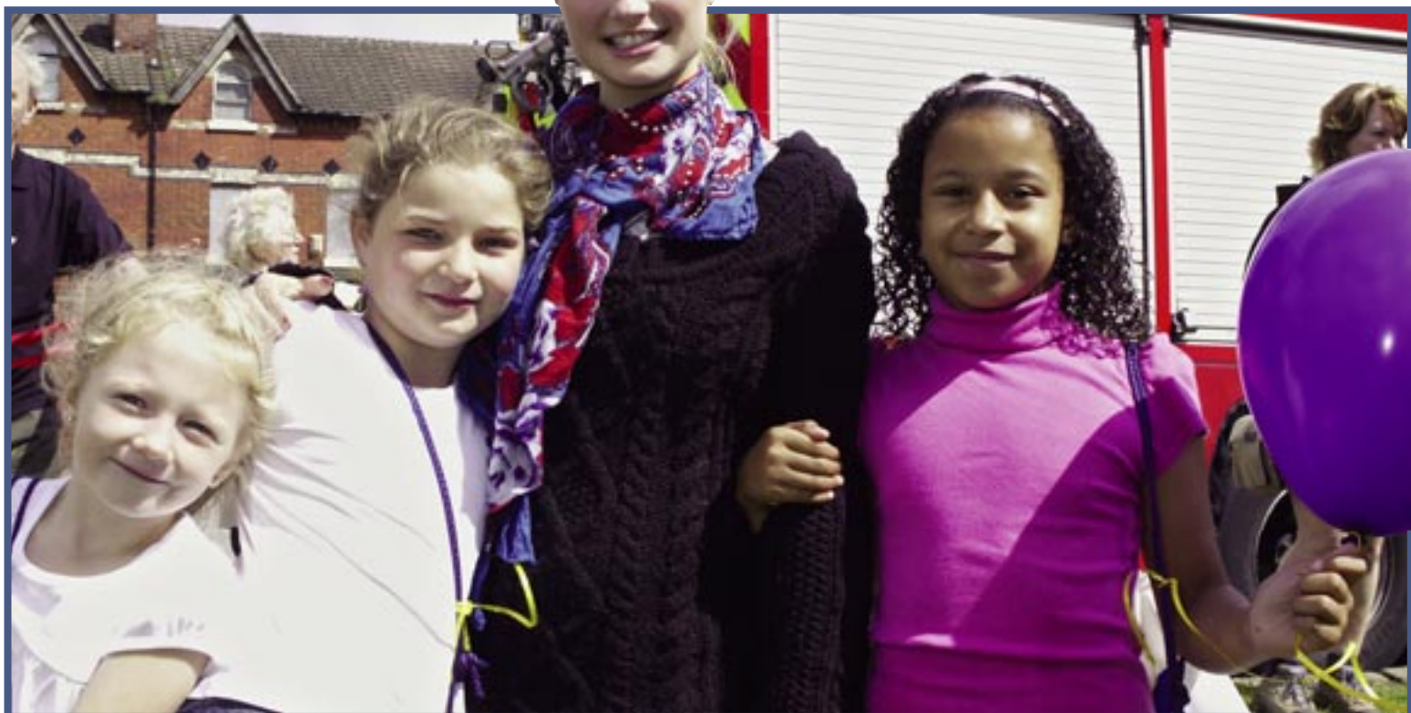
Emma Rigby, who plays Hannah Ashworth in Hollyoaks, meets young fans at the event.

Festival focus on Congolese culture PAGE 7