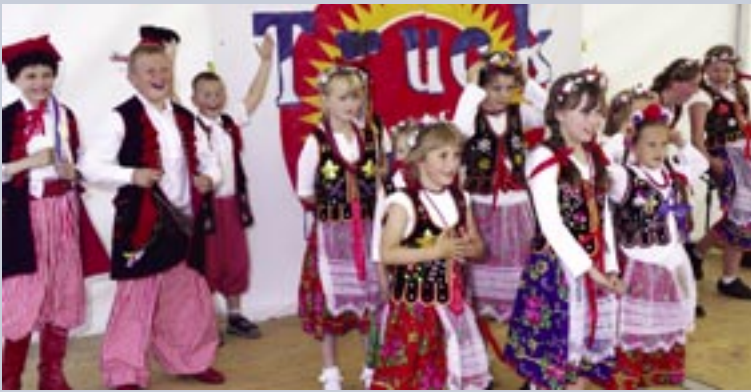
These attractive costumes proved a big hit at the event.

Activities on the day included Victorian games, film screenings, poetry sessions, dancing, portrait painting, music, walking tours, kids workshops, a speakers' corner and much more.