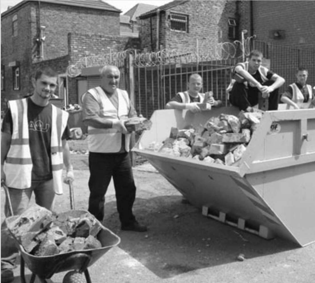
Members of the Circle team are pictured on site sorting out some of the building waste.

A derelict building that had frequently been used for fly tipping has been demolished and cleared. The site will be used as a car park in the future. The demolition work was carried out by unemployed Liverpool residents on placement with a Government New Deal for Young People project, organised by the Liverpool office of TNG Ltd. Then 'green' organisation Circle got involved as part of its drive to improve recycling rates in the construction industry. By hand sorting bricks and other material the company is able to recycle up to 90 per cent of the waste that would normally be taken to landfill. Circle is a joint venture between housing associations Riverside Group and PLUS and construction firm the Seddon Group. Three unemployed Kensington residents recently found work with the company with the help of Kensington Regeneration. Commenting on the clean-up Kensington Community Learning Centre Development Manager, Alan Tapp, said: "This project has been really good news for everyone who uses the centre and also for local residents in our neighbourhood. "Previously the site was a real eyesore which attracted rats because people were constantly tipping rubbish on it. "The fact that the facelift has provided work placements for young people, and that the waste has been disposed of in a 'green' way, are two real bonuses," added Alan.