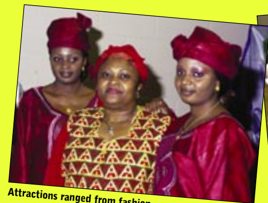
Attractions ranged from fashion.....

All smiles from these two youngsters at the third African Kensington Festival.