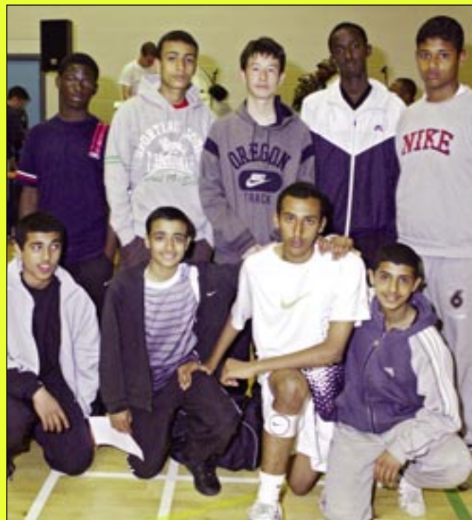
Competitors in the popular football tournament.