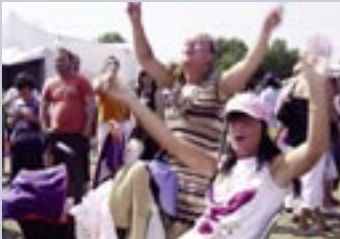
Enthusiastic support at the festival!

More than 2,000 people – double the number expected – attended the Truck Stop event at Edge Hill railway station with visitors from as far afield as Manchester and Wales joining local residents to enjoy a wide variety of