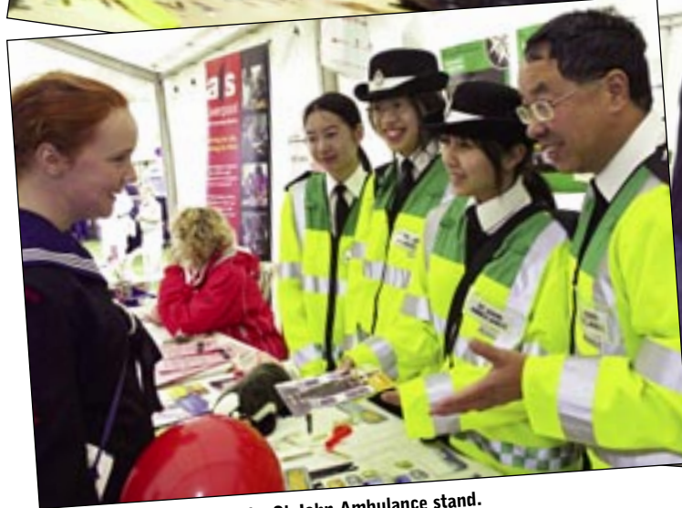
Chatting at the St John Ambulance stand.