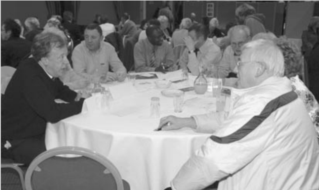
Round-table discussions on key local issues were a feature of the evening.