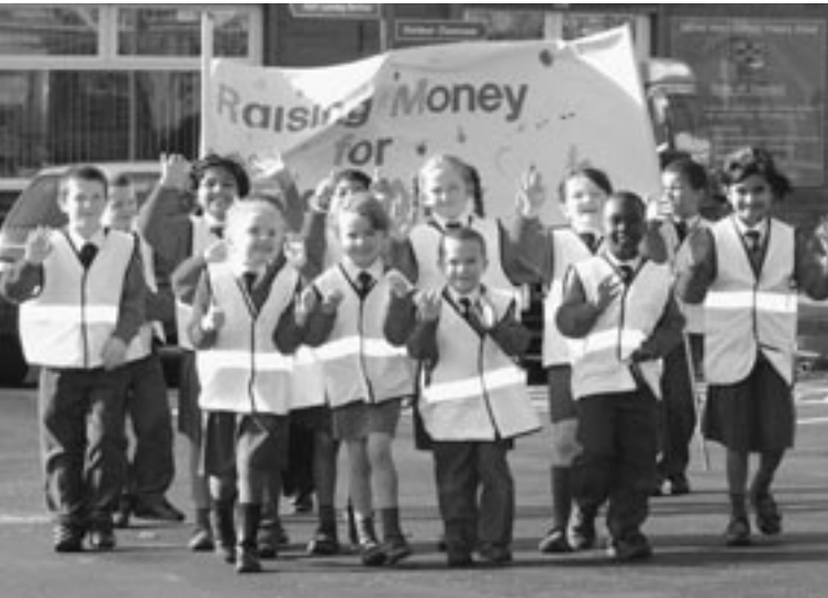
Stepping out for charity - some of the Sacred Heart pupils begin the sponsored walk.