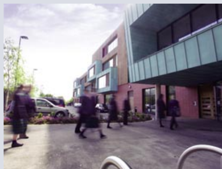
Young people in Kensington will continue to benefit from the striking new Academy of St Francis of Assisi.