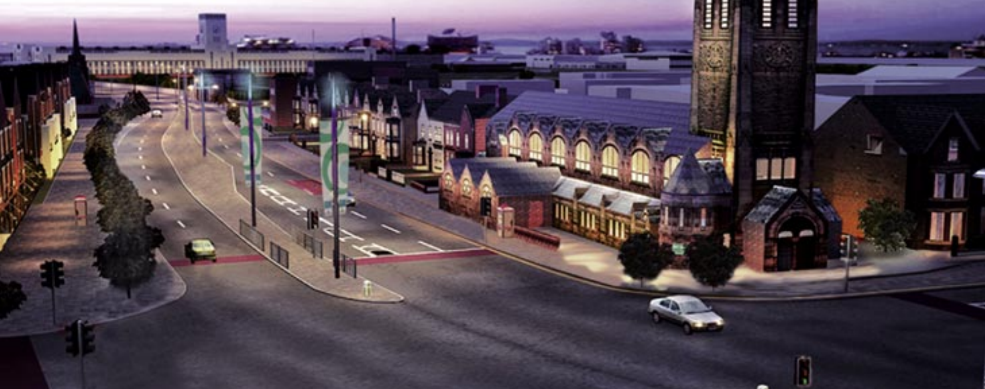
An artist's impression of how Edge Lane West could look after the improvements.

Kensington Regeneration has invited Liverpool Land Development Company to give Kensington News readers an update on the current situation with the Edge Lane Project.