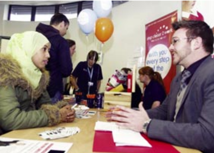
Many residents discussed job and training opportunities at the event.