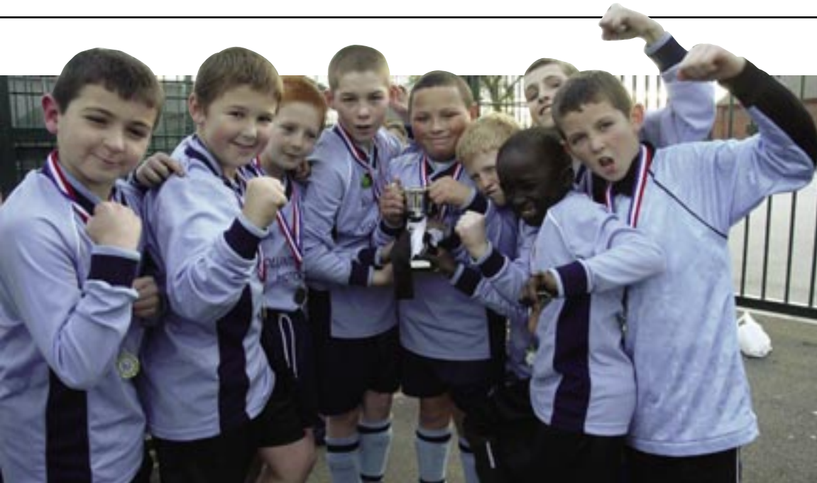
Jubilant Kensington Juniors celebrate winning the tournament at Birchfield Multi-Use Games Area.