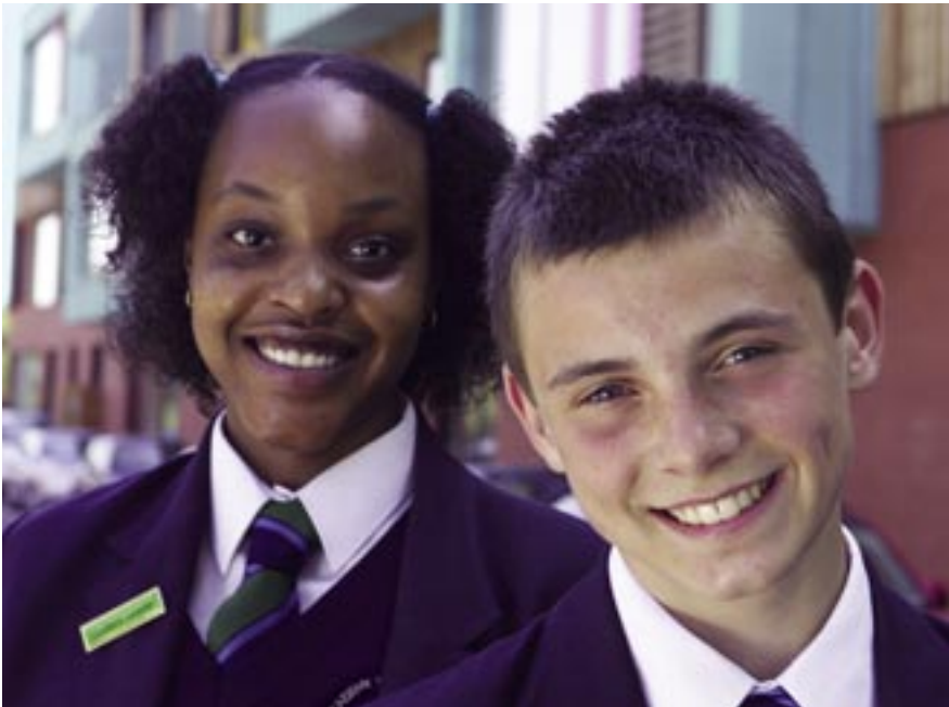
The attainment levels of older pupils in the area have improved significantly.

The work of Kensington Regeneration is having a really positive impact on life in the area, according to the results of a new report. Kensington is one of 39 New Deal for Communities areas across the country and a survey was commissioned by the Government to evaluate the benefits of its investment in all these schemes. The household survey of more than 400 residents living in the NDC area was conducted by MORI in the summer of 2006. It focused in particular on their views of the impact of Kensington Regeneration's efforts between 2004 and 2006 on the key areas of housing and the physical environment, crime, education, health and worklessness. In terms of housing and the