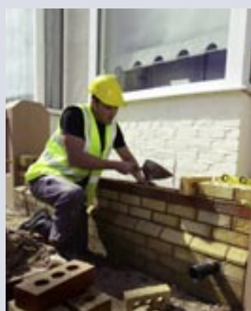
Housing and environmental improvements will continue during the year.

"I would urge everyone in the area to find out more about our projects and how they and their families can benefit from them this year."