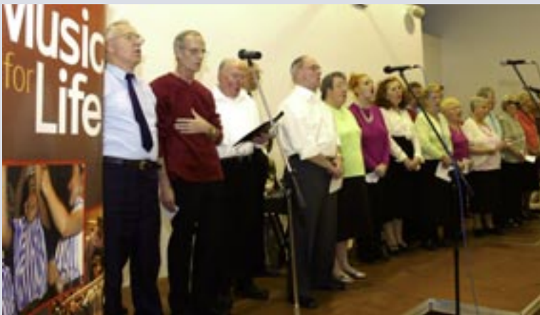
Raising the roof - the Kensington Community Choir performing at the choral evening.

The event, which featured a wide variety of traditional Irish music and dance, was a repeat of the 2005 event and proved to be just as successful.