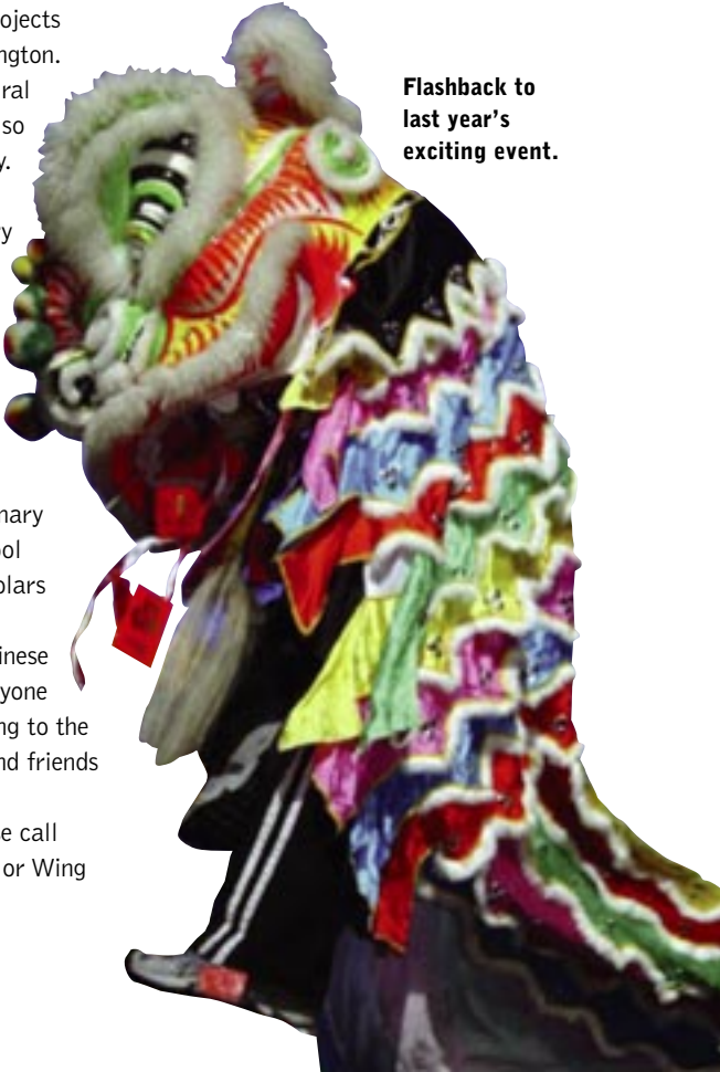
Flashback to last year's exciting event.