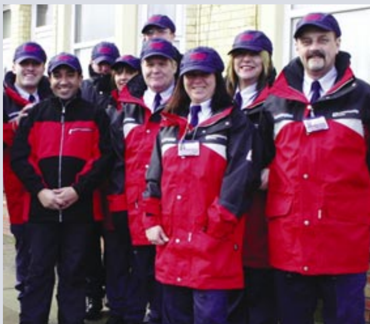
Kensington Regeneration will continue to fund the successful Community Warden scheme in the area.

Kensington Regeneration's vision is 'to enable local people to create a