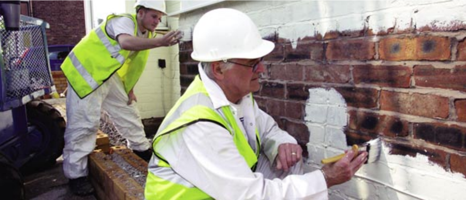
A range of improvements have helped to make Kensington a more popular place to live.