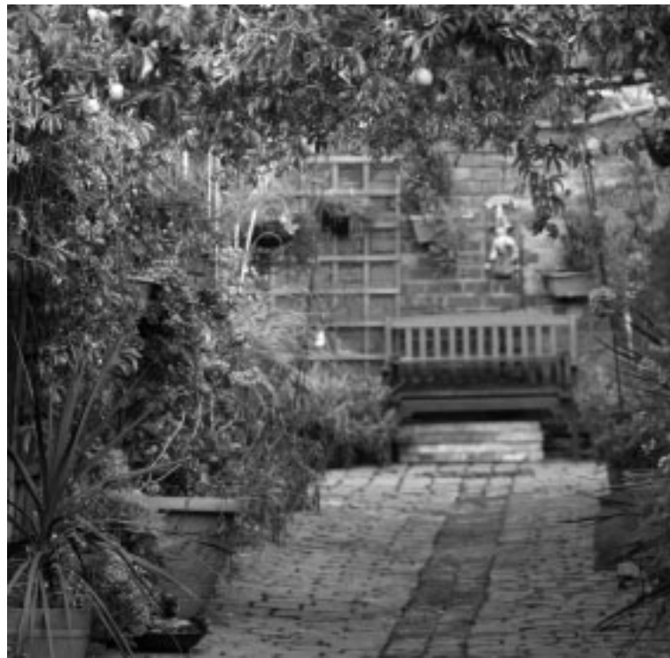
More Kensington residents are now satisfied with the local environment.

"However, this report clearly shows that we are on the right track and that - with the support of local people - it will be possible to continue improving life in Kensington in the years to come."