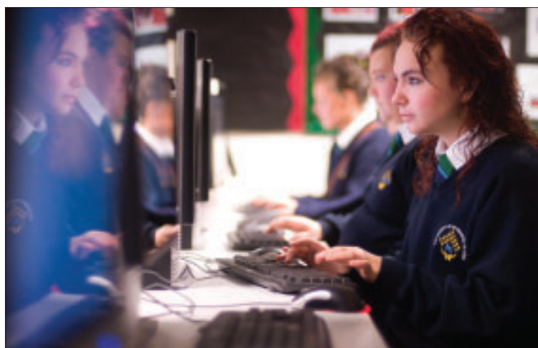
Attainment levels in local schools have increased significantly.