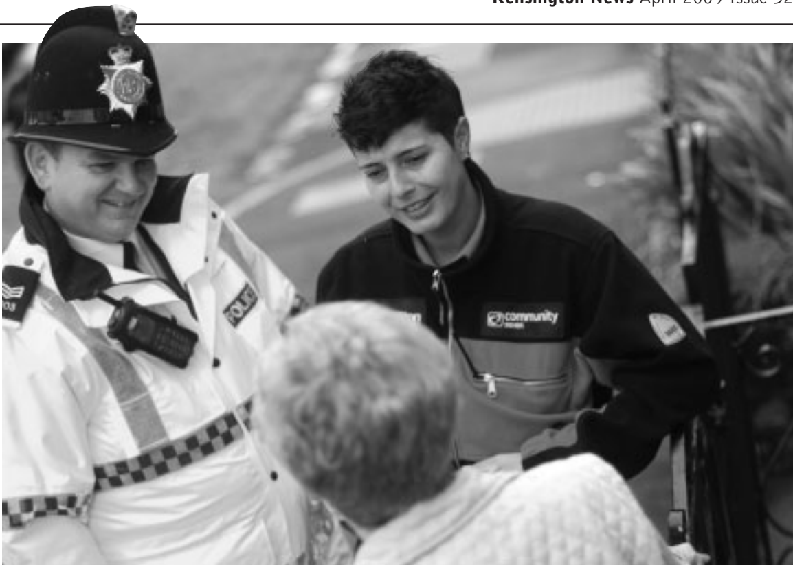
Crime has actually reduced in Kensington in recent years.