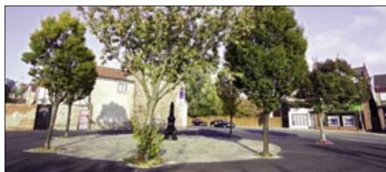
Wavertree Road could be in line for major changes.