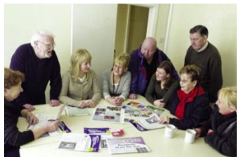
Residents are being encouraged to drop in for information and advice.