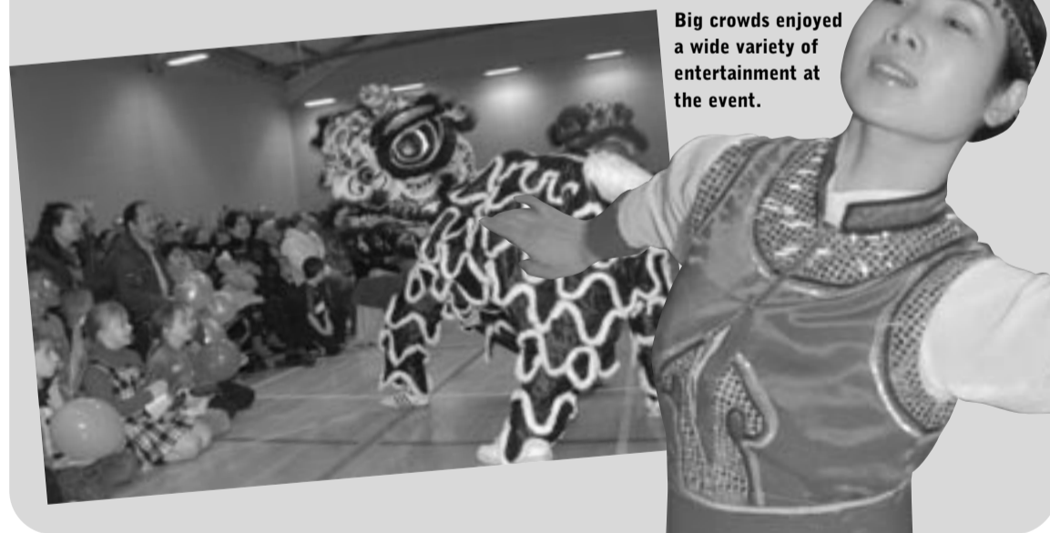
Big crowds enjoyed a wide variety of entertainment at the event.

"I found it particularly heart warming that the hundreds of adults and children who attended were from such a diverse range of cultures."