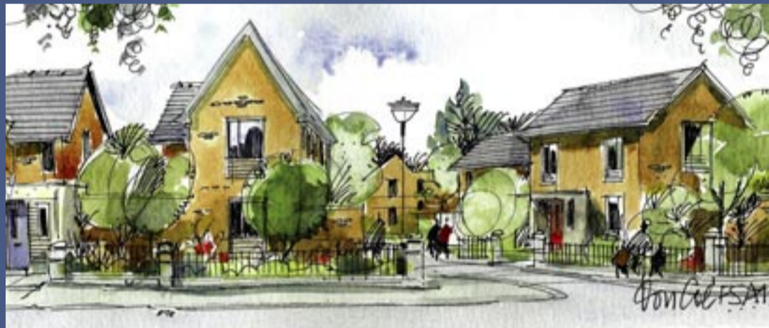
An artist's impression of how homes on Bellway's Tunnel Road scheme will look.