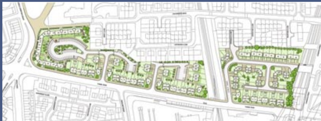
The Tunnel Road site will eventually provide 126 new properties.