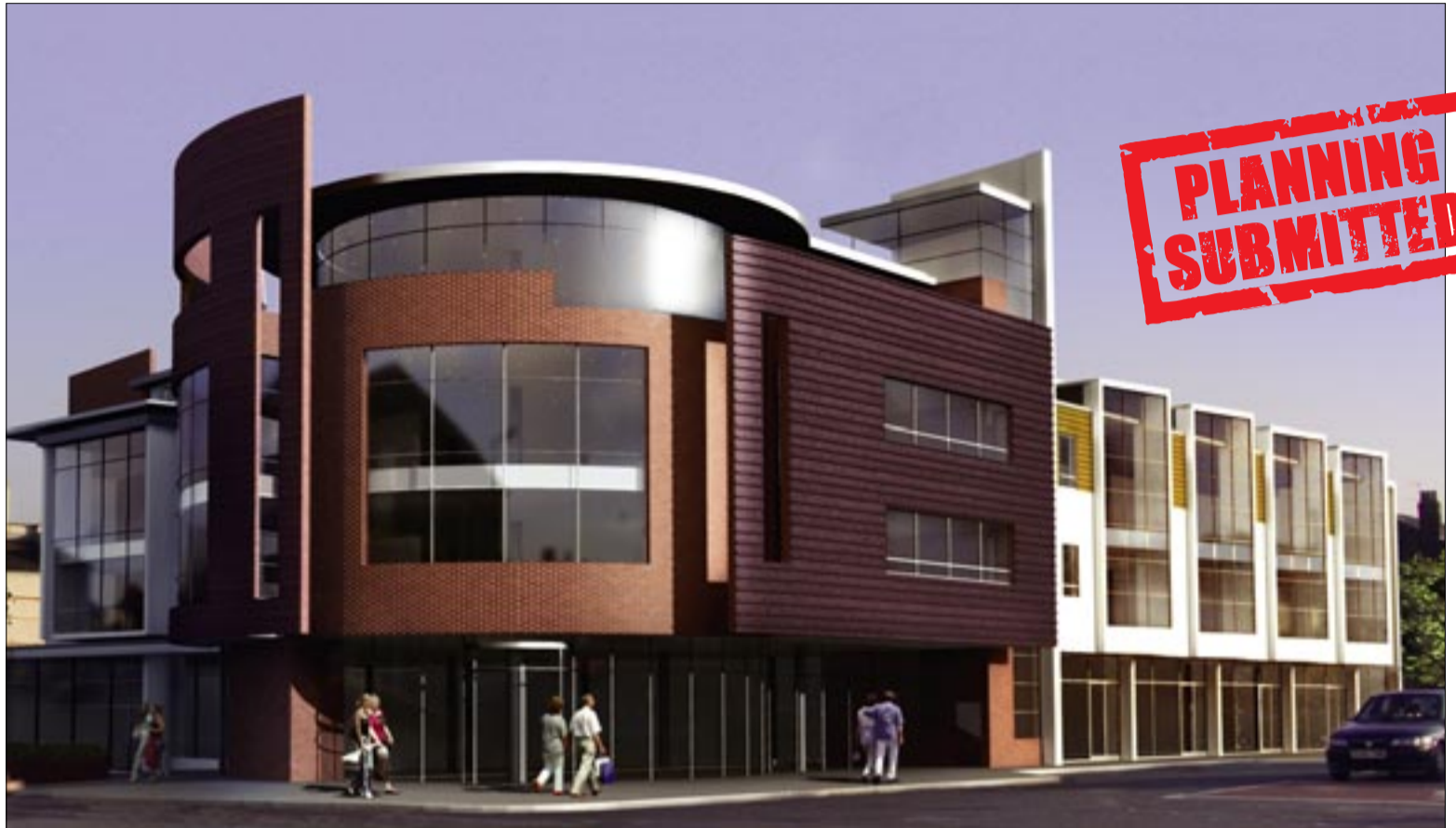
An artist's impression of the Neighbourhood Centre development.