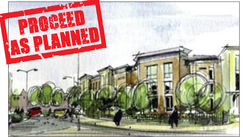
Bellway plan to create 126 new homes at Tunnel Road.

In another development, a planning application has now been submitted for the new £10-million Neighbourhood Centre scheme on