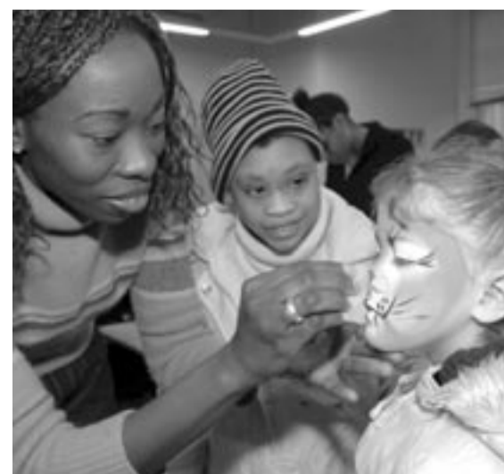
One of more than 150 faces that were painted at the event.

The Eid celebration was the first major event that the group has taken part in since receiving nearly £5,000 for training and development from the Liverpool Culture Company.