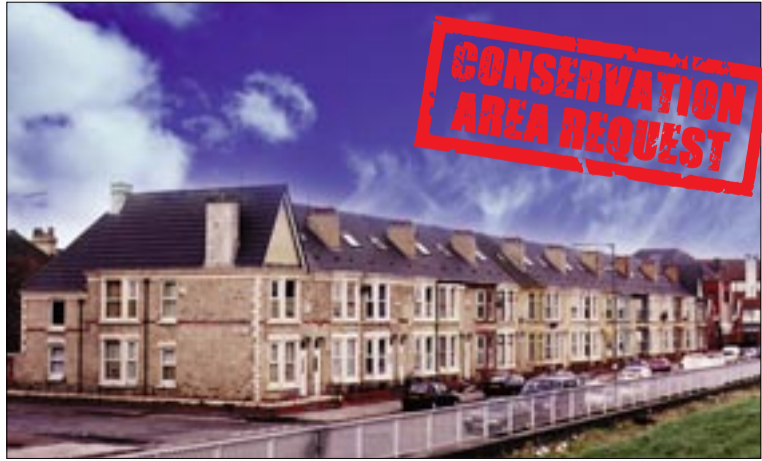
Kensington Fields could obtain conservation area status.

You can read more about the above developments in the following pages of this issue of Kensington News, the community newspaper for the New Deal area.