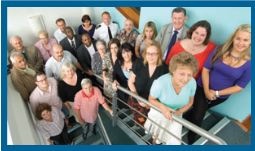
Kensington Regeneration Board Members and staff pictured at the Partnership's Job Bank offices on Tunnel Road

The Kensington Regeneration Board is supported by a staff team including: